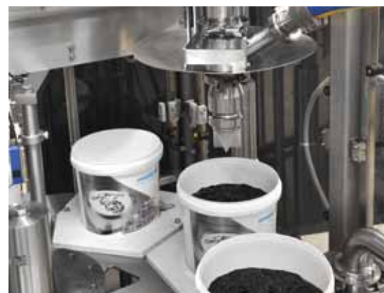
Filling station of the GRUNWALD-HITTPAC XL