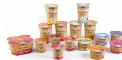
Selection of the wide range of high quality yogurts