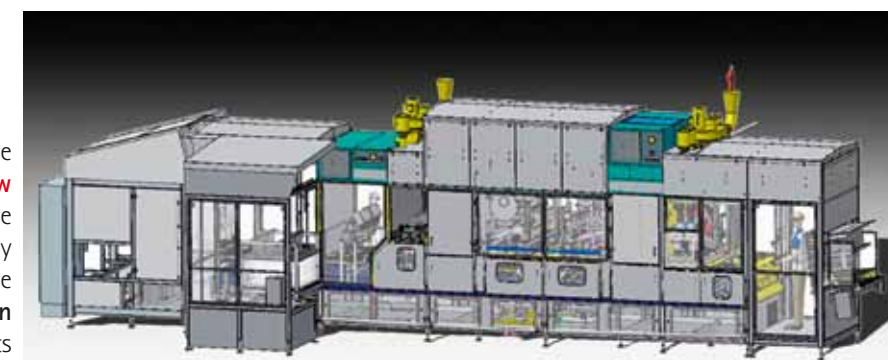
Inline machine FOODLINER 20.000 Ultraclean