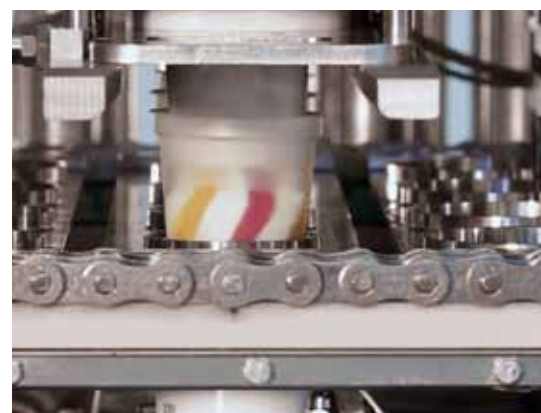
Fascinating filling option with the "swirl" and "side-by-side" technique