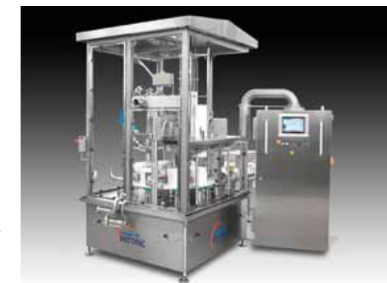
Rotary-type bucket filler