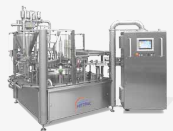
Photo above GRUNWALD-HITTPAC AKH-059/4-lane for filling flavoured set yoghurt into round cups of different sizes

Width of the machine: 1.750 x 1.750 mm 1- to 4-lane version Approximately 2,500 - 10,000 cups/h Dosing range: 10 - 2,000 ml