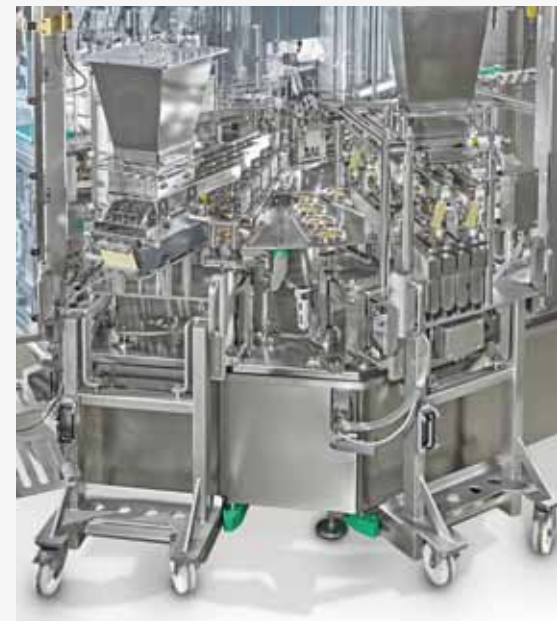
Mobile GRUNWALD dosing systems are suitable for pumpable products and products which are able to trickle. The photo shows two mobile fillers used as decorating stations on a 4-lane rotary-type cup filling machine GRUNWALD-ROTARY 20.000.