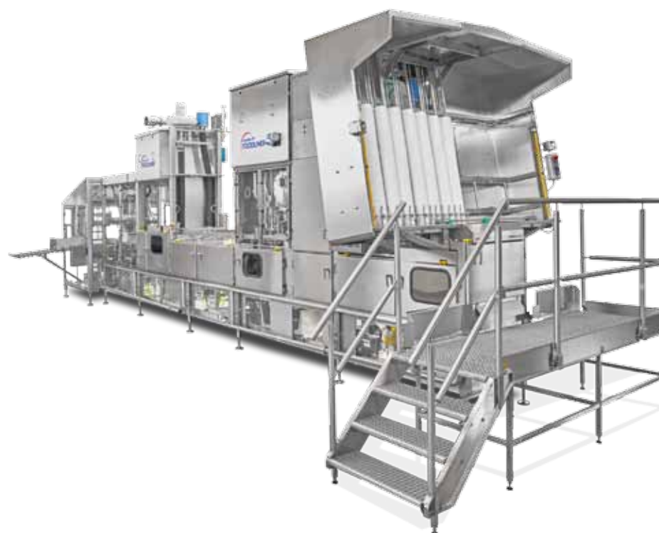
Photo below: Overall view of the GRUNWALD-FOODLINER 3.000/2-lane supplied

Highly exciting unloading situation in Upahl