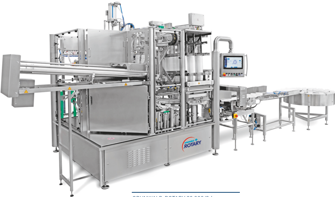
GRUNWALD-ROTARY 20.000/3-lane for filling margarine products in three different round PP cups with the following special features: • Cup storage > 15 min. • Product compensation cylinder in CIP design, with rework connection • Flushing of filler housing with nitrogen • Spin-on-lid station for non-stackable snap-on lids • Complete line concept with weigher, metal detector and collecting table

Numar is a privately owned company that specialises in butter, margarine, vegetable oils and coffee. With approx. 1,000 employees, Numar belongs to “Grupo Agroindustrial Numar SA” and boasts a complete production chain, ranging from the palm plantation to the refinery, up to the customer’s final product.