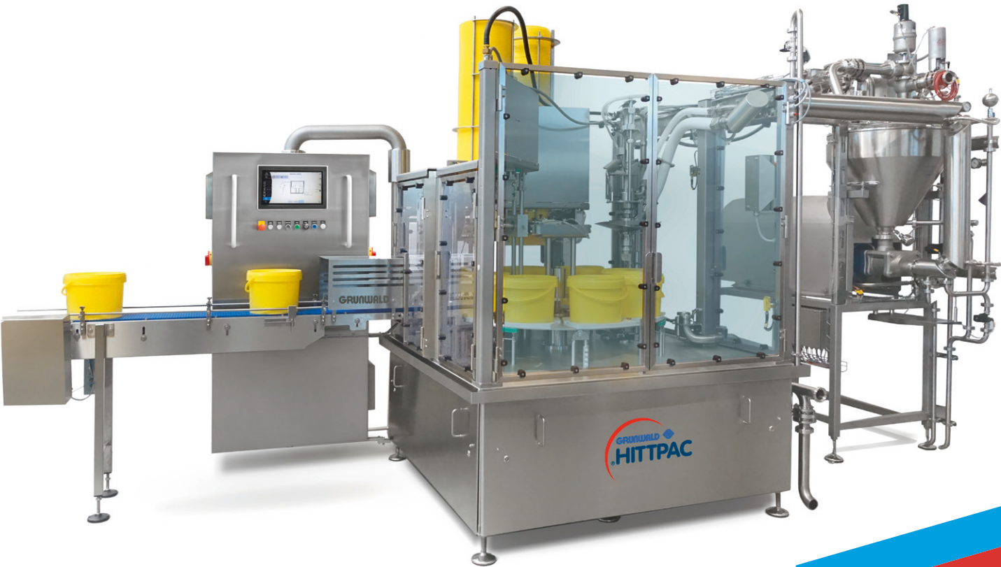
Bucket filler GRUNWALD-HITTPAC XL, 1-lane or filling ketchup and mayonnaise in 1, 2, 5 and 10 kg buckets, as well as vegetable ghee in 0.8 kg and 1.7 kg buckets respectively.

This bucket filler is an investment in a new generation of machines and certainly in the future, since it will allow the customer higher outputs, with less manual labour involved and with high consistency.