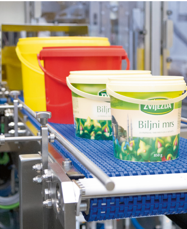
GRUNWALD-HITTPAC XL for filling various products in buckets with different sizes

In the course of time, the sales of delicatessen products like ketchup and mayonnaise in large containers for catering increased significantly. Therefore the customer decided to replace this semi-automatic bucket filling machine with a fully-automatic GRUNWALD bucket filler to meet the increased demand at the end of 2022. For this big step into new automation with GRUNWALD bucket fillers Zvijezda Plus d.o.o. decided on the 1-lane bucket filling machine GRUNWALD-HITTPAC XL for filling ketchup and mayonnaise in 1, 2, 5 and 10 kg buckets, as well as vegetable ghee in 0.8 kg and 1.7 kg